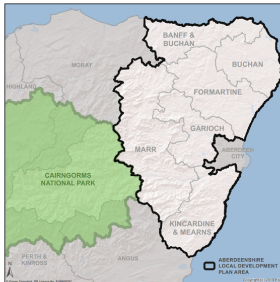
Figure 1 Area of effect of the Aberdeenshire Local Development Plan

The Local Development Plan covers the whole of Aberdeenshire, except that part within the Cairngorms National Park. They have their own Local Development Plan.