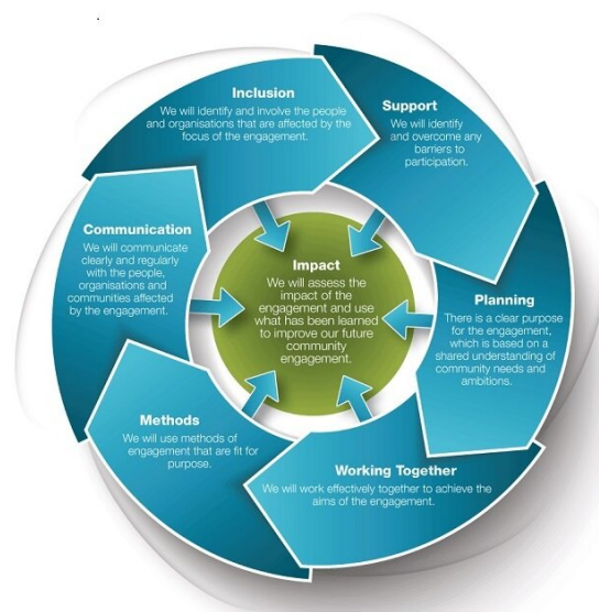
Figure 3 The National Standards for Community Engagement

As a key stakeholder in the process, we will also ensure that Community Councils are kept informed and involved at all stages of the preparation of the plan.