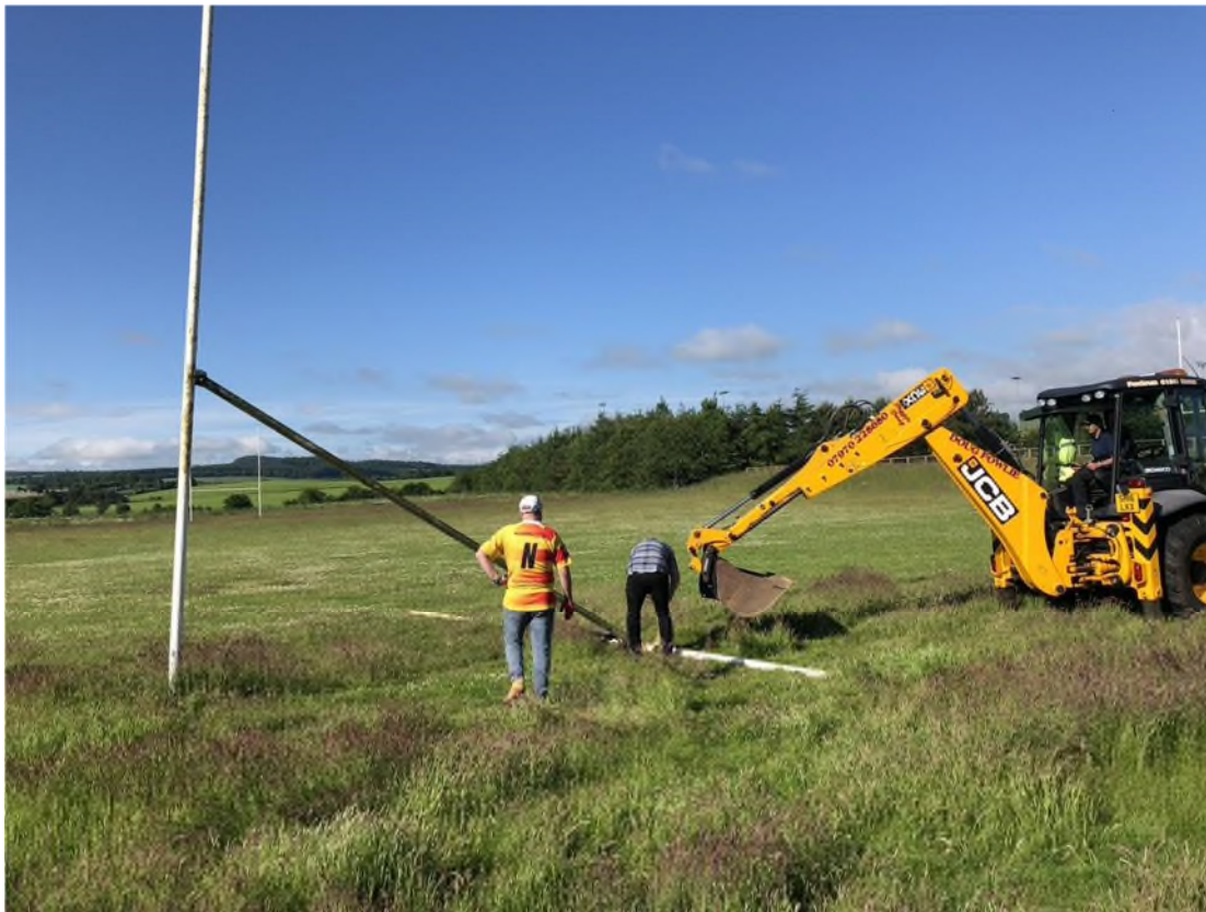
Photo of Post from lower pitch being removed following Seller and their agent's insistence

Our incumbent landlord at Redcloak, has made it clear that there will be no renewal or extension of our current lease when it expires in six years' time for the remainder of the facilities. They have ambitions for alternative uses due to the proximity to small businesses and the recycling centre. He is unwilling to offer any other area of land for purchase by the club which provides long term security for the club.